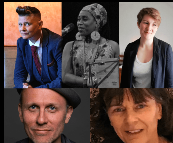
The Forward Prize for Best Single Poem - Written (£1,000)