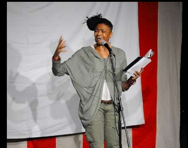
The Forward Prize for Best Single Poem - Performed (£1,000)

The Forward Prizes for Poetry have established themselves as the major awards for contemporary poetry in the UK and Ireland.