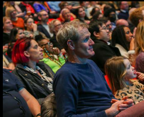
The Felix Dennis Prize for Best First Collection (£5,000)