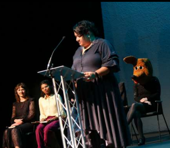
The Forward Prize for Best Collection (£10,000)

For 30 years we have supported poets from the start to the peak of their careers with our prizes.