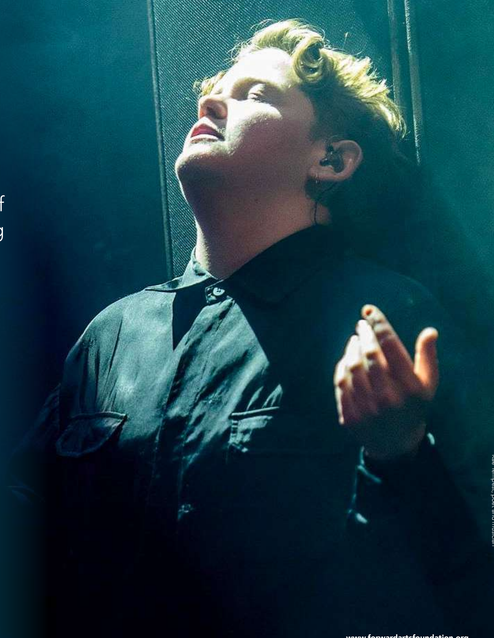
Kae Tempest, poet and musician

That's why, for the first time in Forward's 30-year history, we're introducing a new Prize for performance/spoken word poetry.